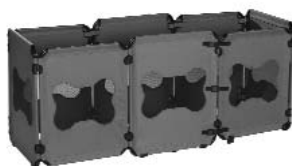
6 Ft. x 2 Ft. Run