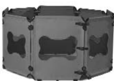
5 Ft. Circle