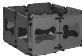
4 Ft. Square

Connect two or more for larger Exercise Pens!